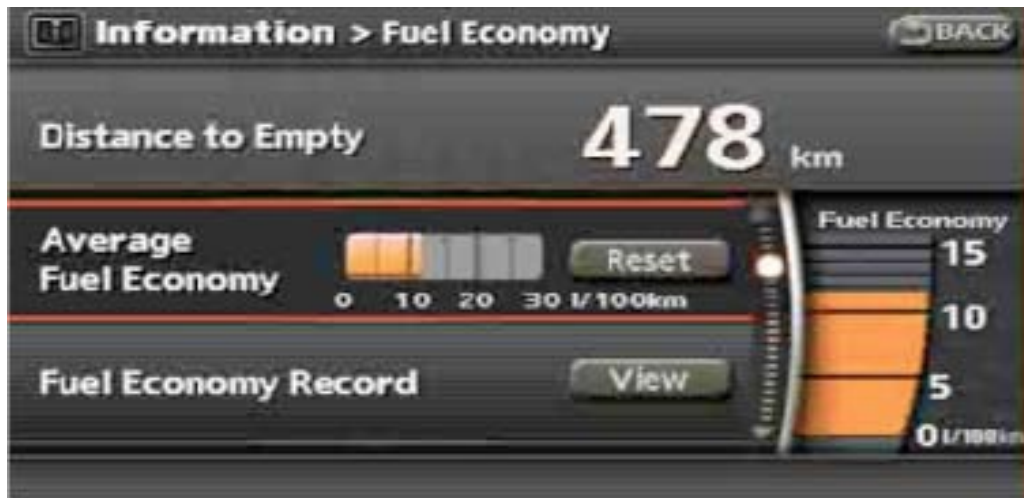
Figure 1: Fuel Efficiency Gauge Installed in All New Nissan Models Worldwide (Image from: http://www.greencarcongress.com/2007/08/all-new-nissan-.html )

The Nissan fuel efficiency gauge, shown below, uses internal sensors to display both historical trends in driving efficiency and current fuel consumption information.