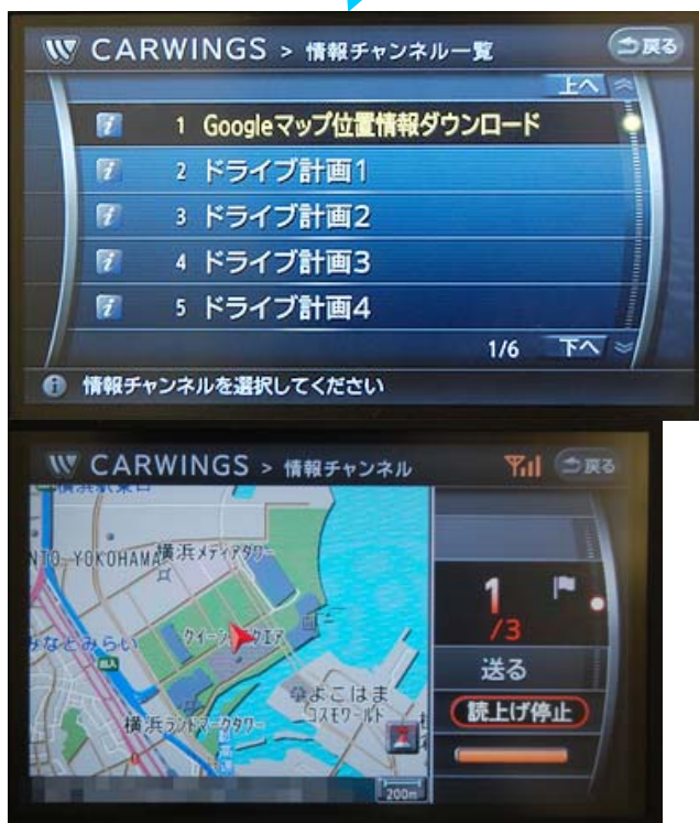
Figure 2: CARWINGS In-car Navigational and Driving Efficiency Software.

The CARWINGS program operates through a combination of steering wheel switches and voice commands (top photo), allowing drivers to access maps, real-time traffic information, nearby businesses, information about their personal driving records, and driving tips while they are on the road.